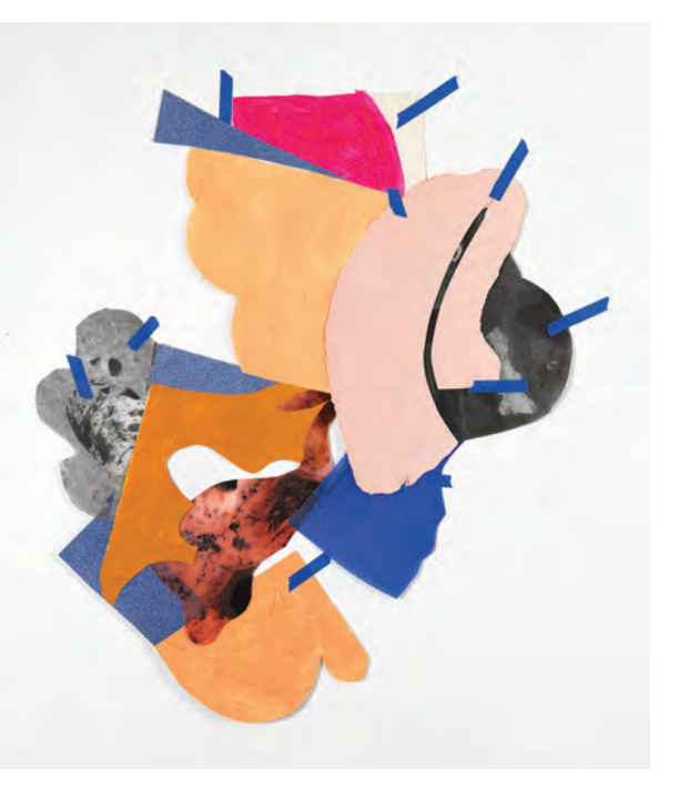
Wall Collage #3, paper, mixed media collage, 37 x 27", 2016

And yet, underlying the humor of this work are the forces that subtly drive much humor: anxiety, frustration, and doubt. Moses' paintings sit at the intersection of the painter's and the viewer's anxiety - the painter's anxiety about successfully resolving the work, the viewer's anxiety, perhaps subconscious, about what may happen next. There is tension, however pleasurable, between the expected fixedness of the painting and the evident latent mobility of the painting's forms. Among her influences Moses cites Philip Guston and Renaissance painters, so it is not surprising that the conclusion of Guston's July 1965 ARTnews essay "Piero della Francesca: The Impossibility of Painting" offers us a key to her new work: "Is the painting a vast precaution to avoid total immobility, a wisdom which can include the partial doubt of the final destiny of its forms? It may be this doubt which moves and locates everything." Mary Bucci McCov is a painter based in Beverly, MA who exhibits nationally and frequently writes about art.