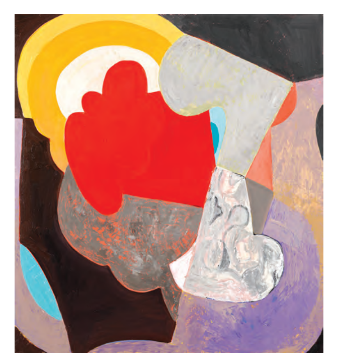
Red Cloud, oil on wood panel, 33 x 30", 2016