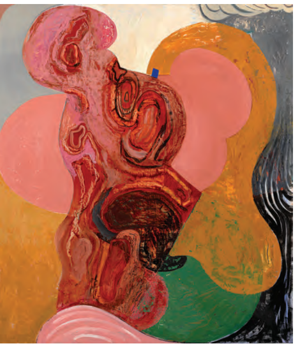
Better Angel, oil on wood panel, 48 x 42", 2016