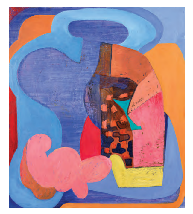
Me Myself and E, oil on wood panel, 48 x 42", 2016