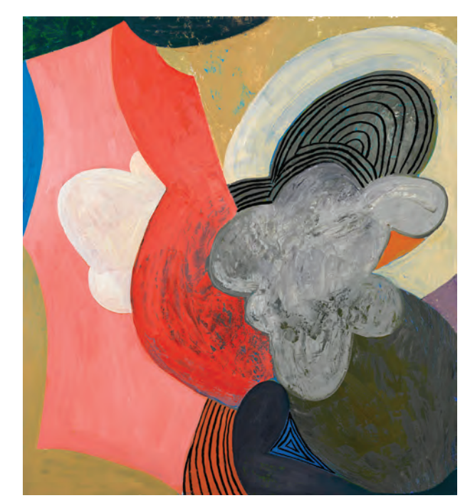
Gray Cloud, oil on wood panel, 33 x 30", 2016

Wall Collage, paper, mixed media collage, 79 x 68″, 2016